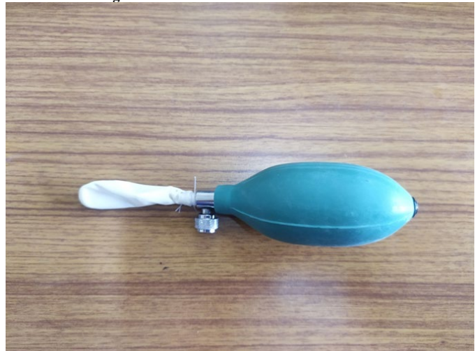
Figure 2: endonasal balloon release instrument

Endonasal cranial balloon release: It is a powerful physical technique that adjusts the bones of the skull and face. After explaining the entire procedure and assurance, the patient is made to lie supine on the treatment couch. Nasal Skeletal Release is performed using a finger cot/balloon attached to a blood pressure bulb. (Figure 2) The finger cot is lubricated and then placed into each of the six nasal passages one by one. Once the balloon is positioned properly, the balloon is then quickly inflated which mobilizes the bones of the face and cranium. It is a very quick procedure and feels similar to the sensation of water shooting up in the nose. The opposite nostril is lightly compressed to prevent air from escaping. The patient takes a deep breath through the mouth and holds it then the finger cot is gently inflated making its way into the nasopharynx, causing it to widen. The finger cot is inserted into the inferior turbinate of the nose on both sides on the first day, then into the middle turbinate on the second day, then into the upper turbinate on the third day, and then into all three nasal passages of both sides on the fourth day. The patient was given four treatment sessions on continuous days.